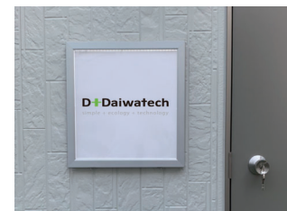
LED sign panel

The sign features a thin design and a clean frame shape. It is suitable for posting announcements and as a signboard. At night, it automatically turns on with a timer setting. It also serves as lighting for hands and feet during disasters.