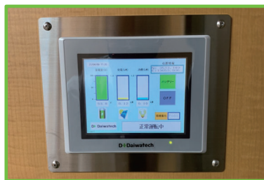
Display unit (LCD screen)

A Western-style toilet with a bidet is provided.